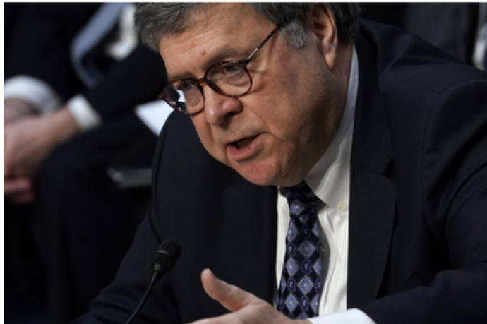
U.S. Attorney General William P. Barr