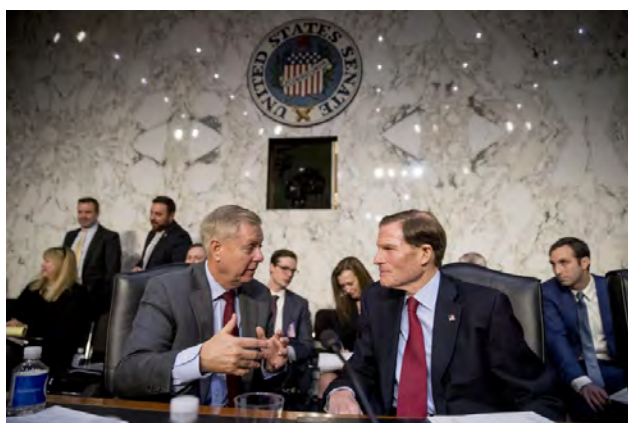
The Act amends the Decency Act Section #230, cited in EIE's Presidential Pledge. (Pictured: Sen. Graham and Sen. Blumenthal).