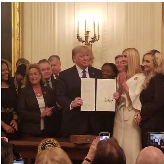
EIE's President participated in the White House Summit on Human Trafficking celebrating the 20 year anniversary of the Trafficking Victims Protection Act .

EIE's bi-partisan Pledge, signed by Donald J. Trump In 2016, promising to enforce existing federal laws and advance policies to prevent the sexual exploitation of children online, was significant in securing key victories including: